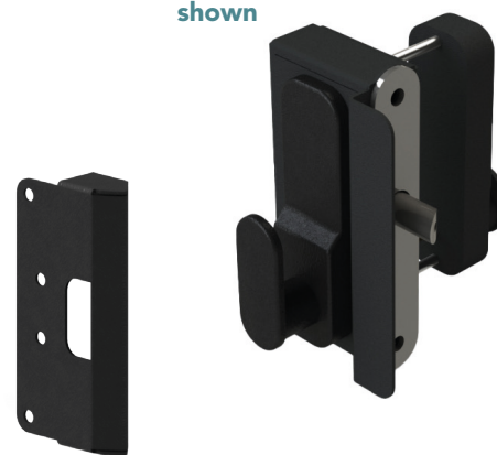
BDGW keep (supplied with lock)