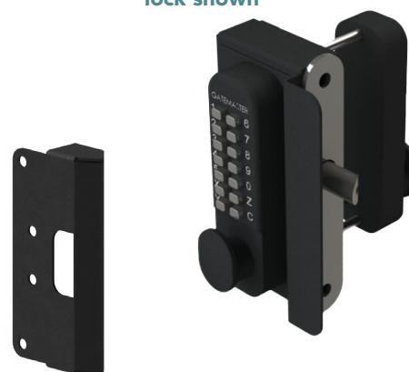
BDGW keep (supplied with lock)